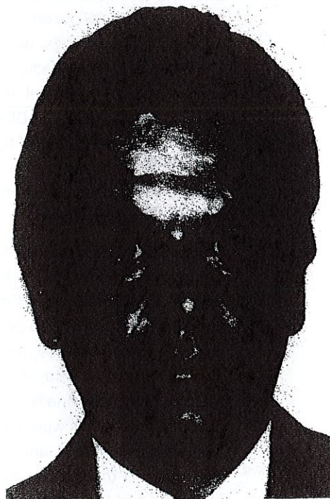
Undated photo of Enrique Camarena.